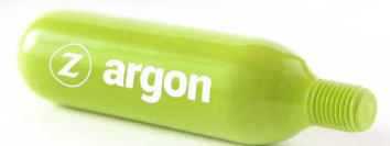
Opti-Purge™ on-board argon purge